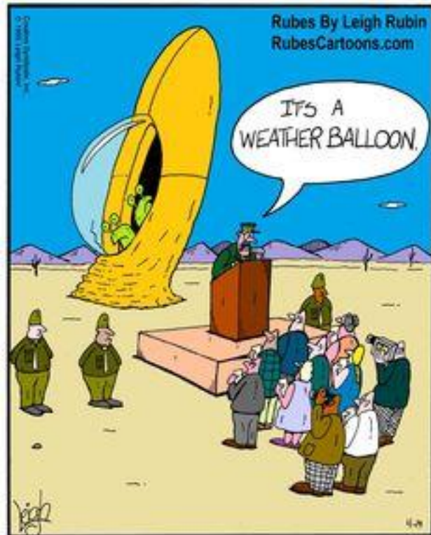
Naturally, there was a bit of skepticism among the media regarding the official Air Force explanation.