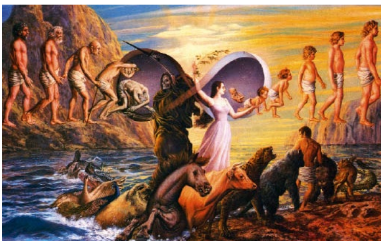
The law of Karma and reincarnation: In an endless cycle, we return to earth until we have learned to control our energies.

Reincarnation is a fact. That it is no longer a part of today's Christian beliefs is due to one power-hungry woman who had all references to reincarnation in the early Bible removed. A seemingly small act with historical consequences: how different would the history of the last two millennia have been if mankind had known that they themselves would reap the fruit of their (mis)deeds in a future earthly life—that they would have to sleep in the beds they had made?!